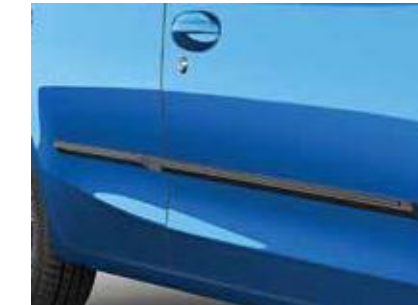
SIDE PROTECTION MOULD